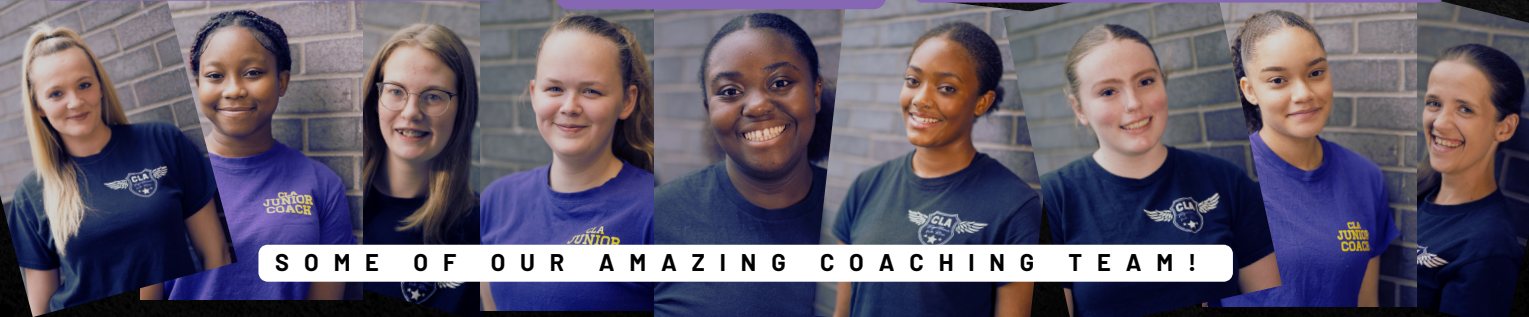
SOME OF OUR AMAZING COACHING TEAM!